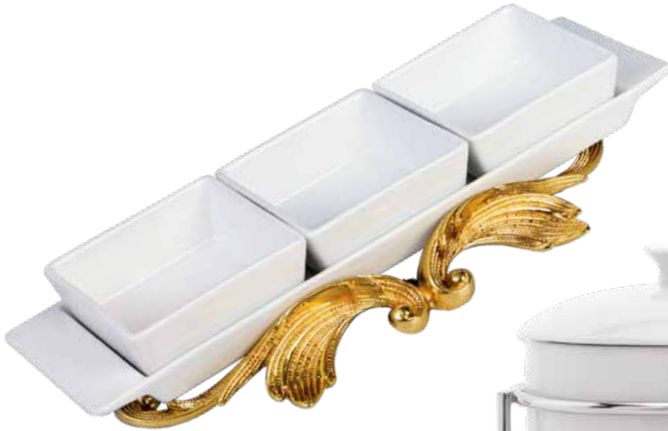
TBT00085: 30x17 - H.5

PORCELAIN AND BRONZE GOLD OR SILVER FINISHING