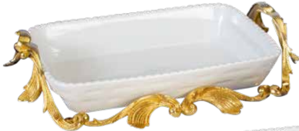
TBT00033: 36x30 - H.9

PORCELAIN AND BRONZE GOLD OR SILVER FINISHING