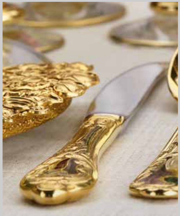
TABLE KNIVES HAVE NOW EVOLVED ACCORDING TO THEIR USE. THE SHARP POINT HAS MOSTLY DISAPPEARED, WITH THE SERRATED EDGE ONLY ON ONE SIDE OF THE BLADE.

KNIVES WERE THEN VERY SHARP AND SERRATED ON BOTH SIDES OF THE BLADE, SO THEY COULD BE USED TO CUT AND SKEWER MEAT TO RAISE IT TO THE MOUTH.