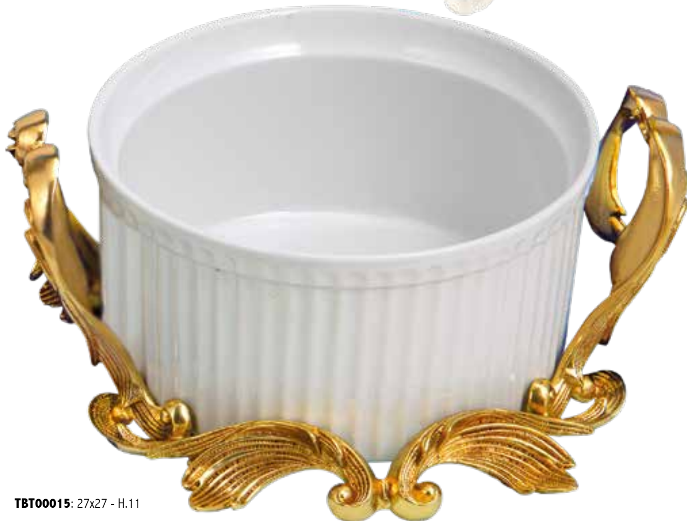
TBT00015: 27x27 - H.11