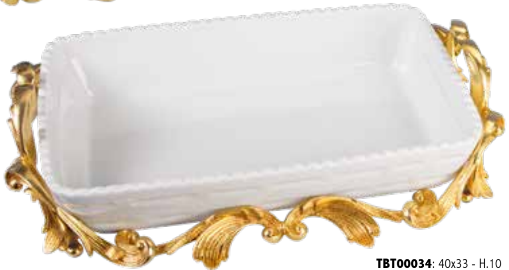
TBT00034: 40x33 - H.10