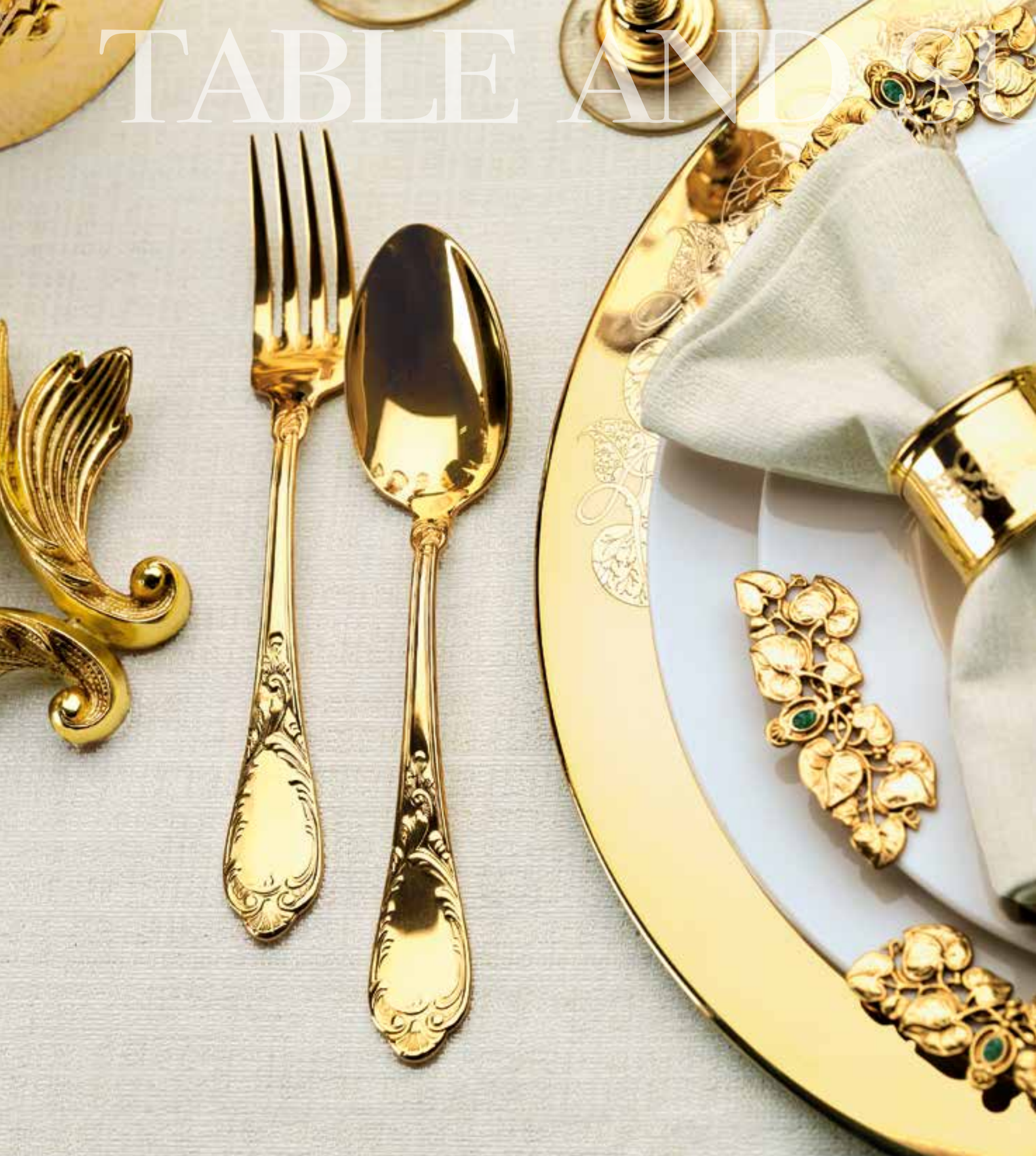
TABLE AND CHAIR