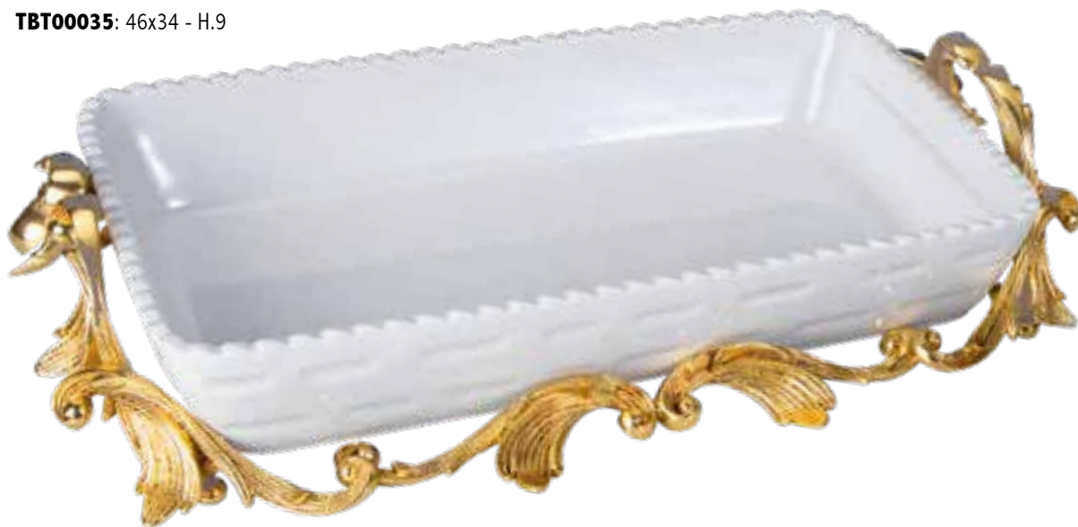
TBT00035: 46x34 - H.9