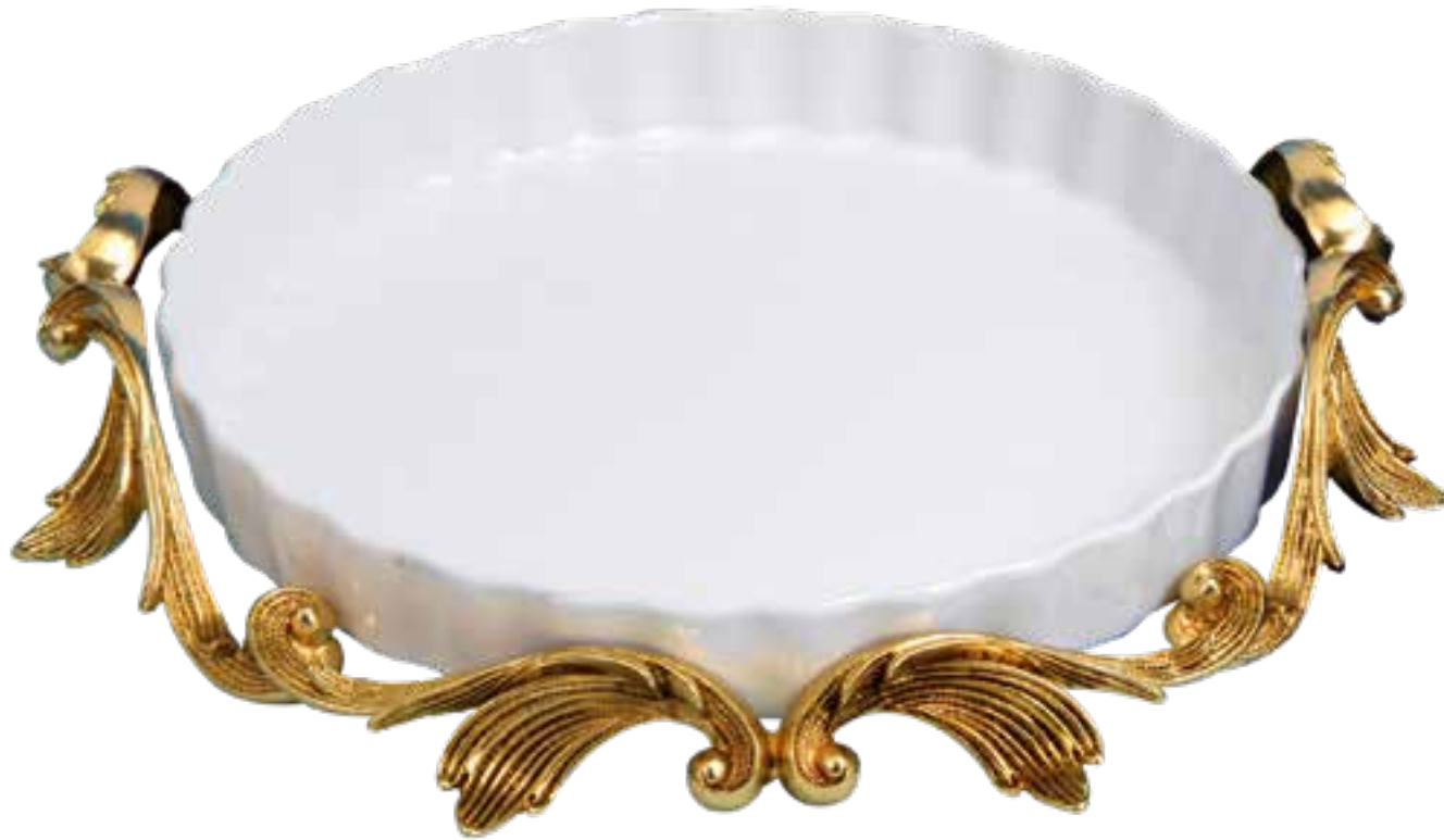
TBT00025: D.30 - H.5

PORCELAIN AND BRONZE GOLD OR SILVER FINISHING