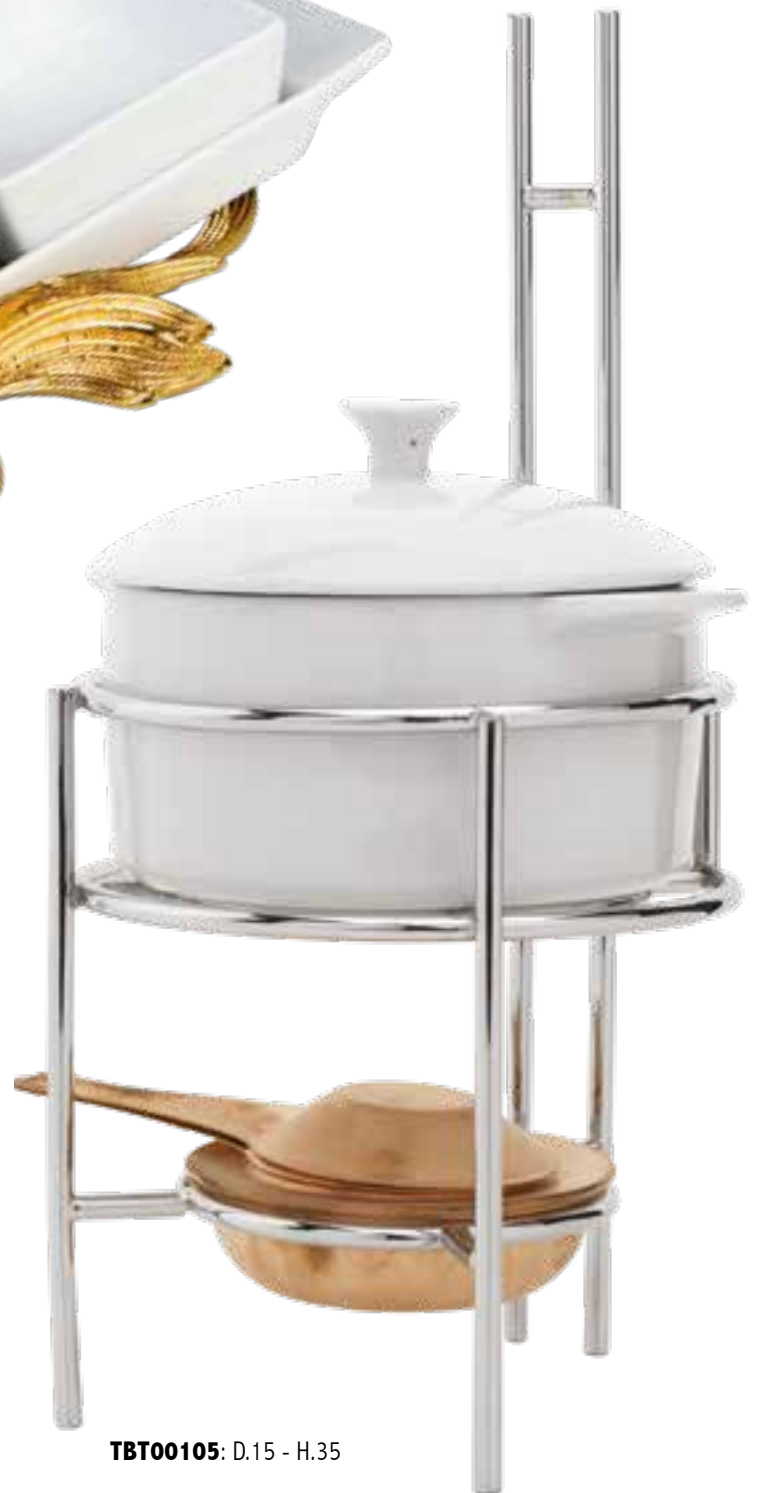
TBT00105: D.15 - H.35