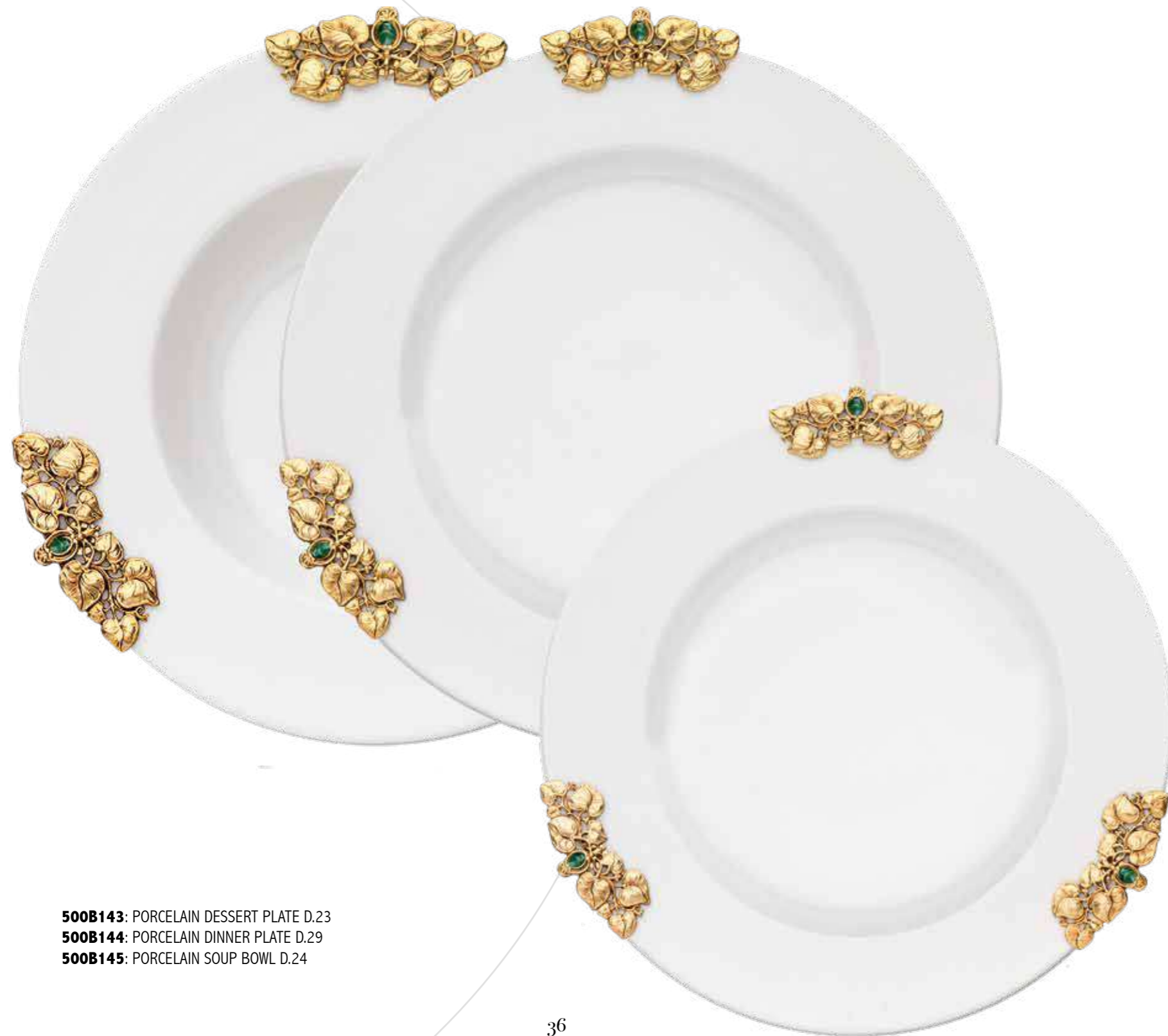
500B143: PORCELAIN DESSERT PLATE D.23 500B144: PORCELAIN DINNER PLATE D.29 500B145: PORCELAIN SOUP BOWL D.24