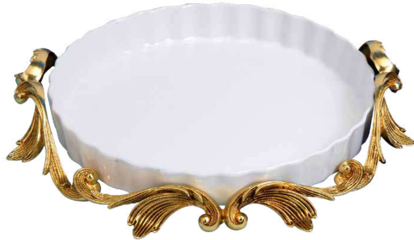
TBT00025: D.30 - H.5

PORCELAIN AND BRONZE GOLD OR SILVER FINISHING