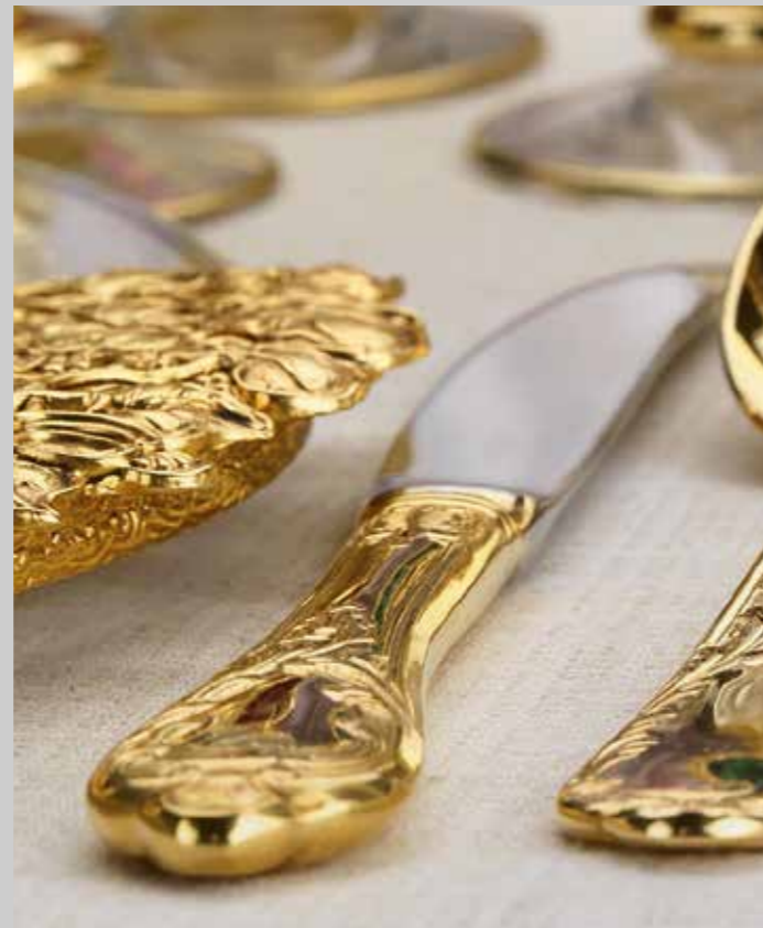
TABLE KNIVES HAVE NOW EVOLVED ACCORDING TO THEIR USE. THE SHARP POINT HAS MOSTLY DISAPPEARED, WITH THE SERRATED EDGE ONLY ON ONE SIDE OF THE BLADE.

KNIVES WERE THEN VERY SHARP AND SERRATED ON BOTH SIDES OF THE BLADE, SO THEY COULD BE USED TO CUT AND SKEWER MEAT TO RAISE IT TO THE MOUTH.