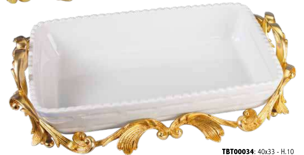
TBT00034: 40x33 - H.10