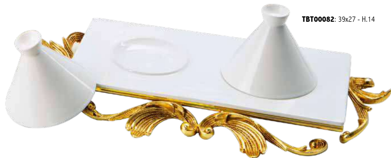
TBT00082: 39x27 - H.14