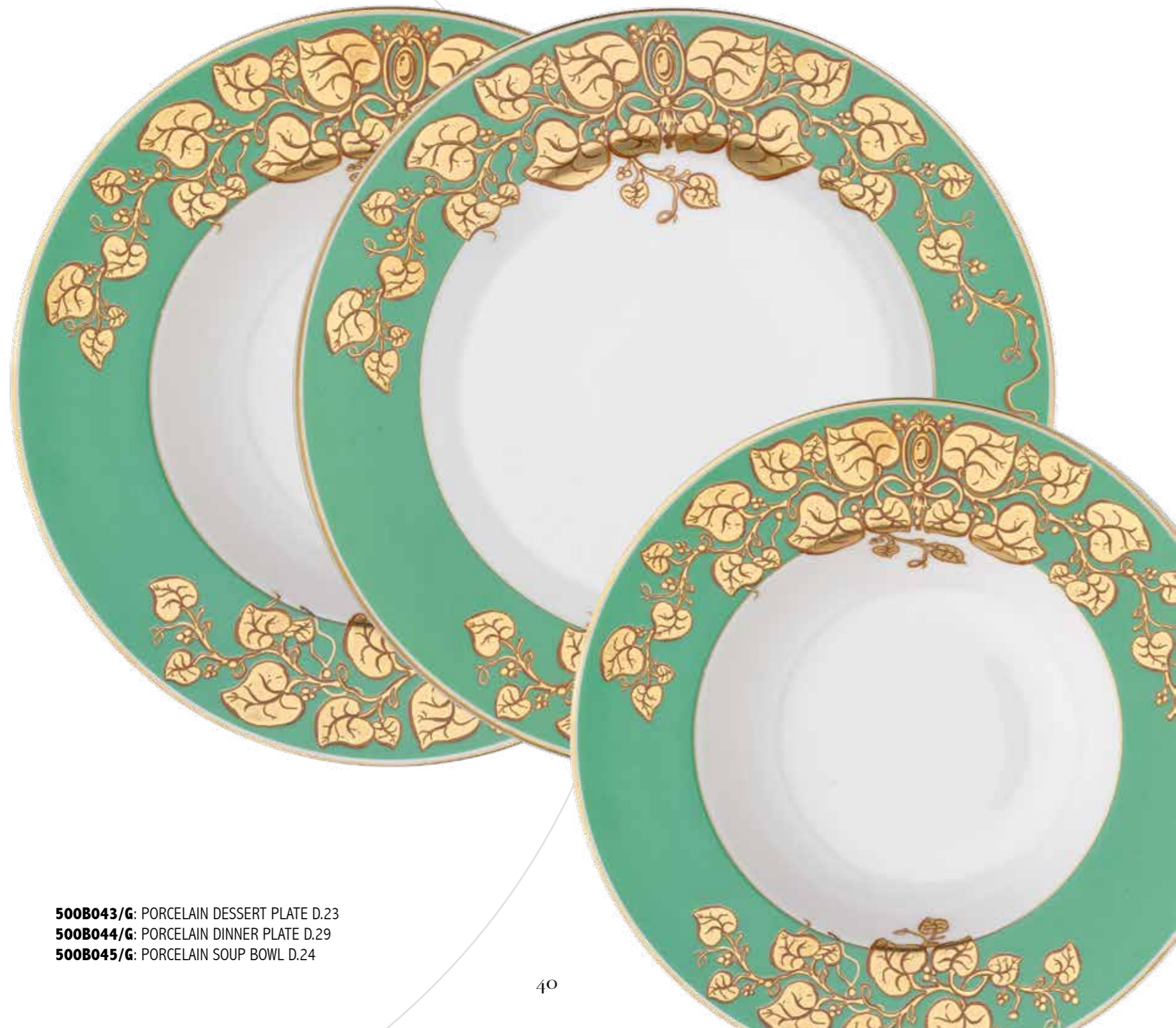
500B043/G: PORCELAIN DESSERT PLATE D.23 500B044/G: PORCELAIN DINNER PLATE D.29 500B045/G: PORCELAIN SOUP BOWL D.24