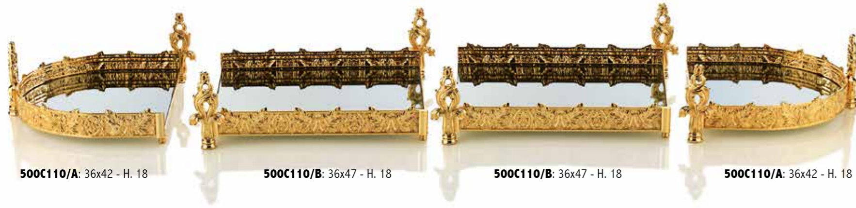
500C110/A: 36x42 - H. 18