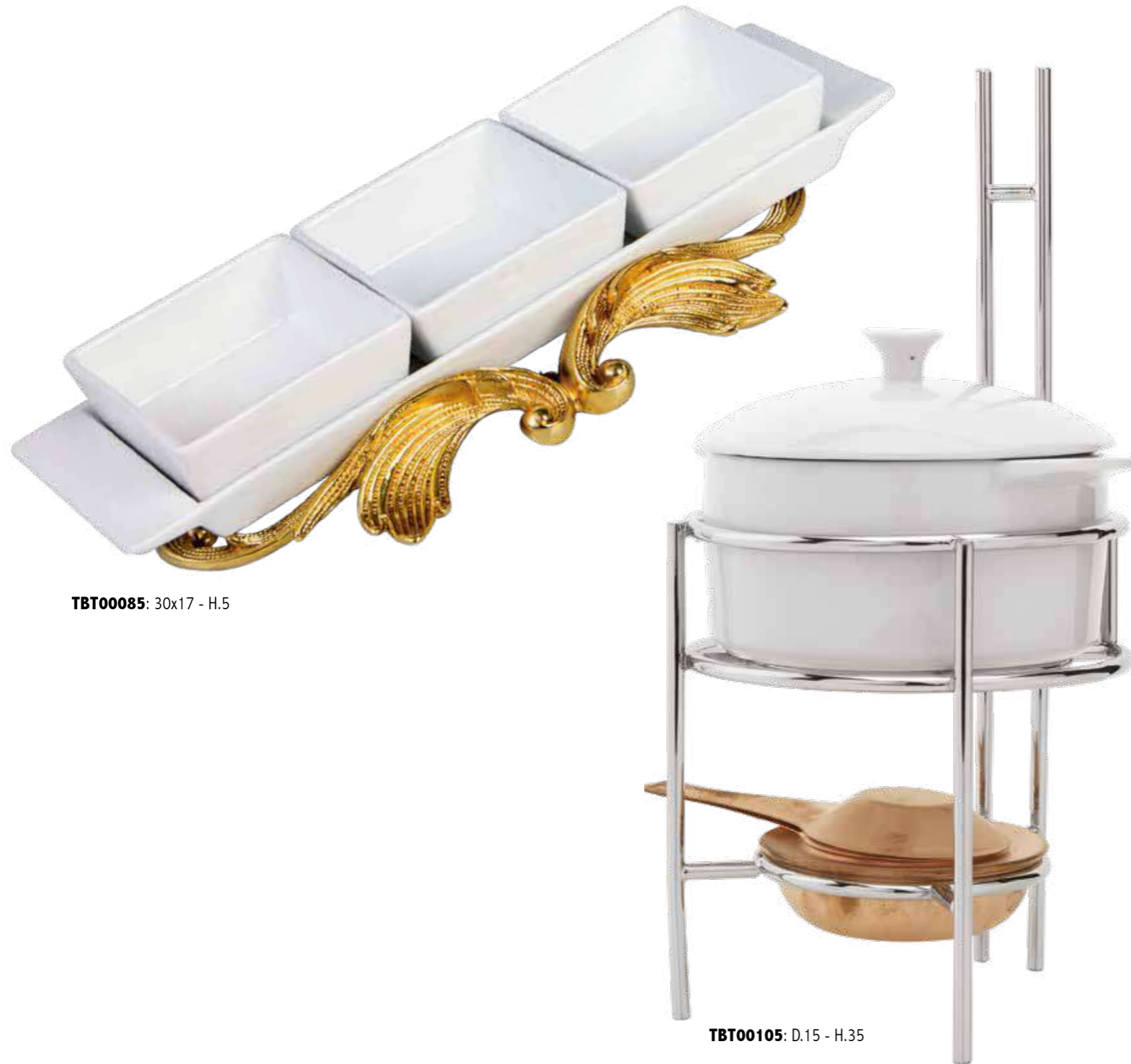
TBT00085: 30x17 - H.5

PORCELAIN AND BRONZE GOLD OR SILVER FINISHING