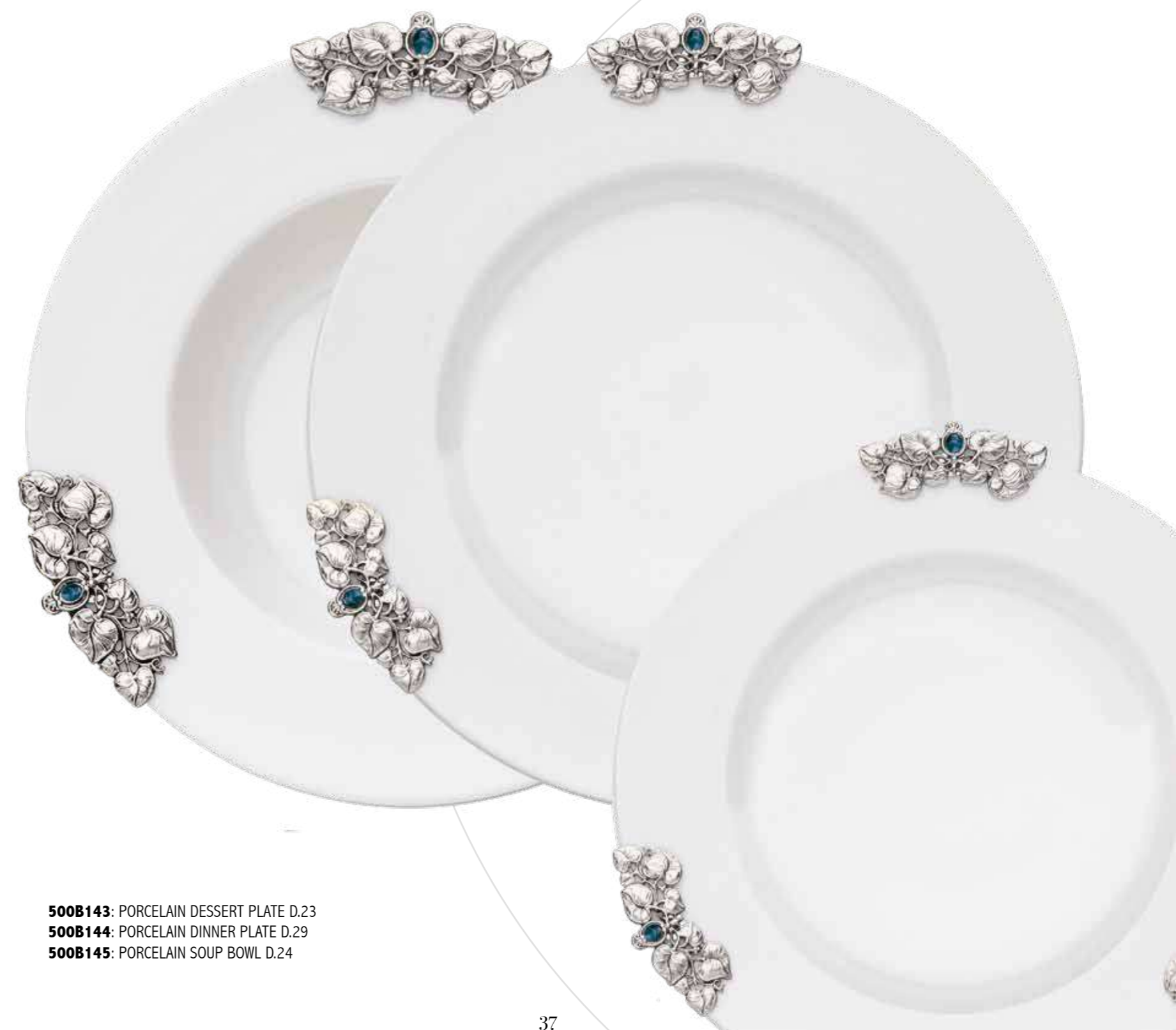
500B143: PORCELAIN DESSERT PLATE D.23 500B144: PORCELAIN DINNER PLATE D.29 500B145: PORCELAIN SOUP BOWL D.24