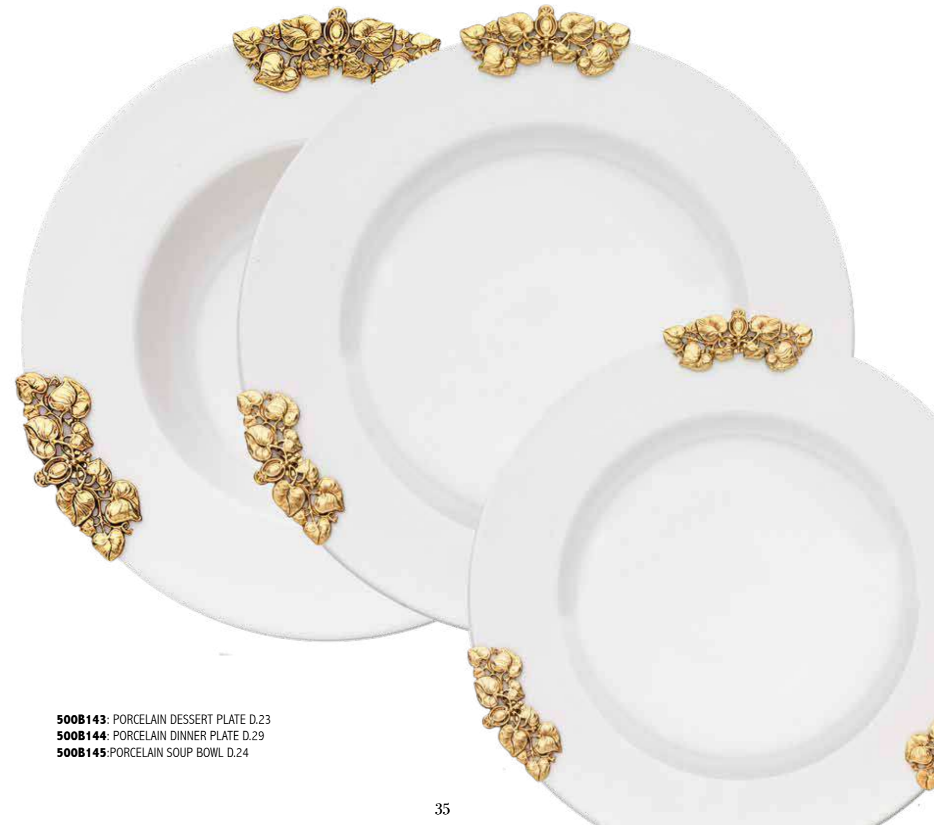
500B143: PORCELAIN DESSERT PLATE D.23 500B144: PORCELAIN DINNER PLATE D.29 500B145: PORCELAIN SOUP BOWL D.24