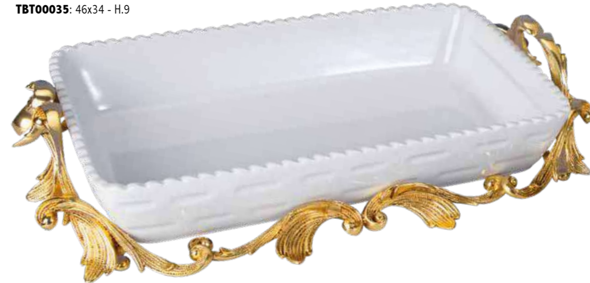
TBT00035: 46x34 - H.9