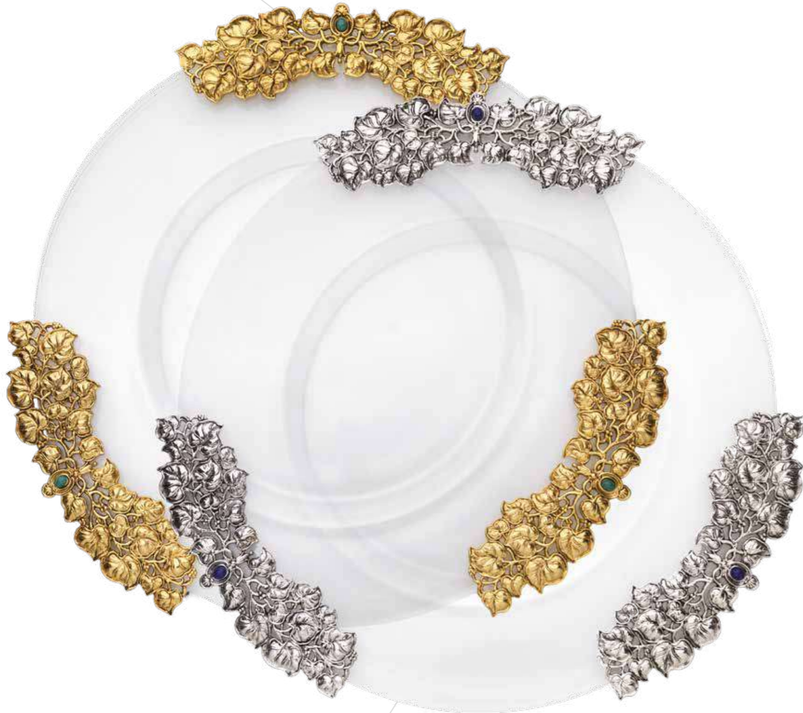
500B047: GLASS CHARGER PLATE D.35 WITH ONE ORNAMENT 500B048: GLASS CHARGER PLATE D.35 WITH THREE ORNAMENT