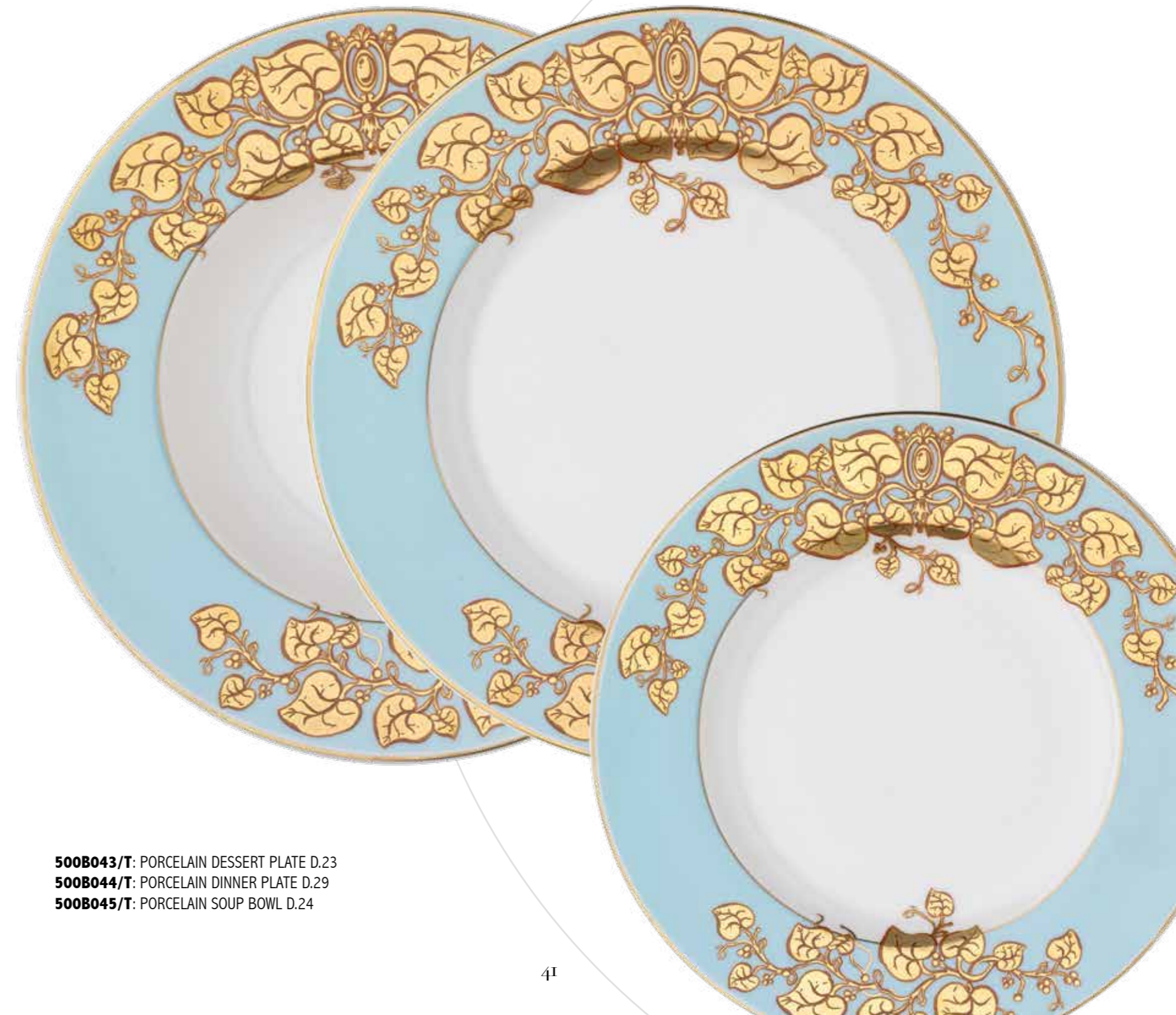
500B043/T: PORCELAIN DESSERT PLATE D.23 500B044/T: PORCELAIN DINNER PLATE D.29 500B045/T: PORCELAIN SOUP BOWL D.24