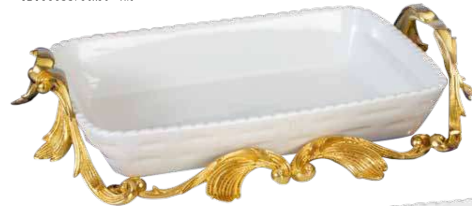
TBT00033: 36x30 - H.9

PORCELAIN AND BRONZE GOLD OR SILVER FINISHING