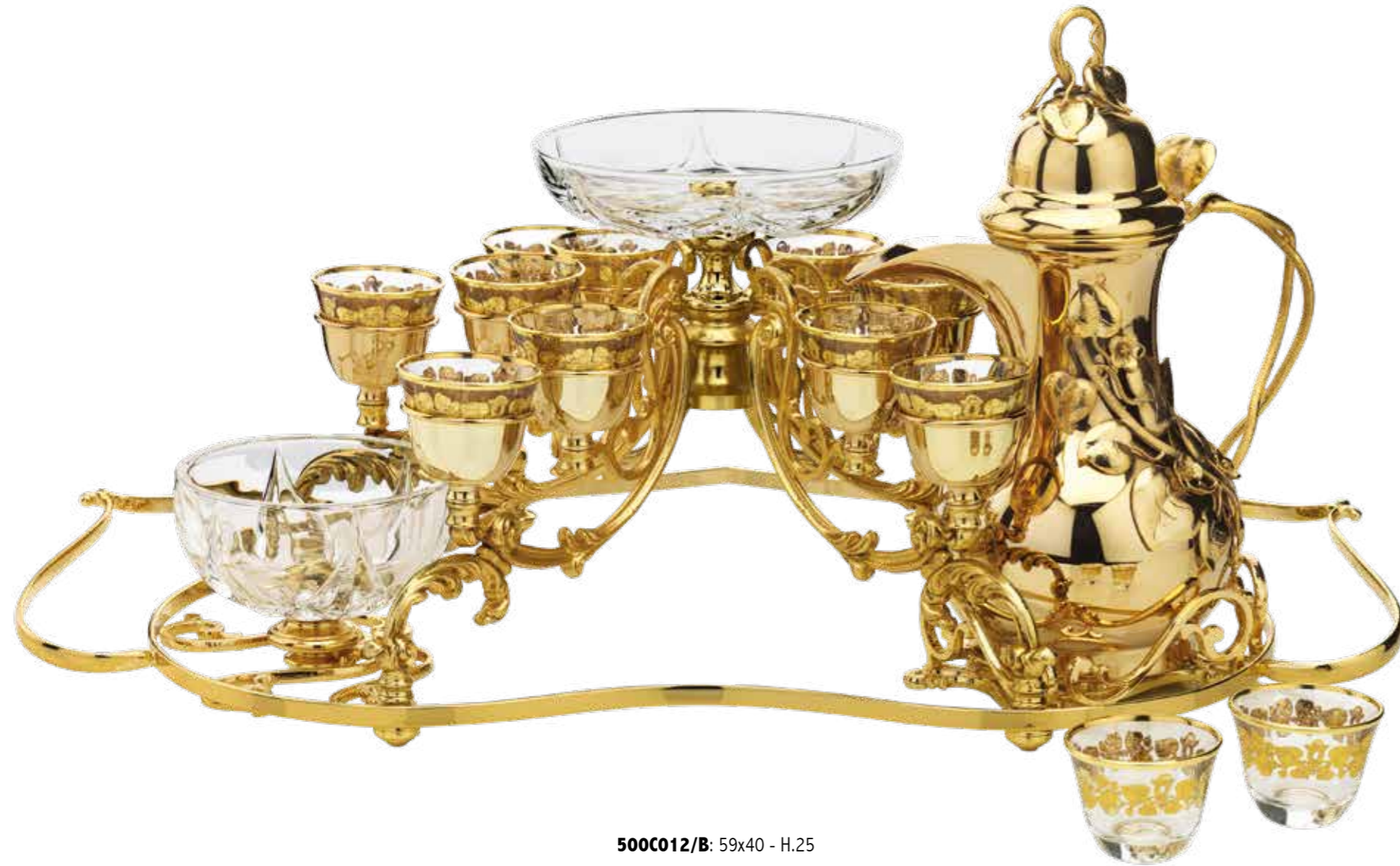
500C012/B: 59x40 - H.25