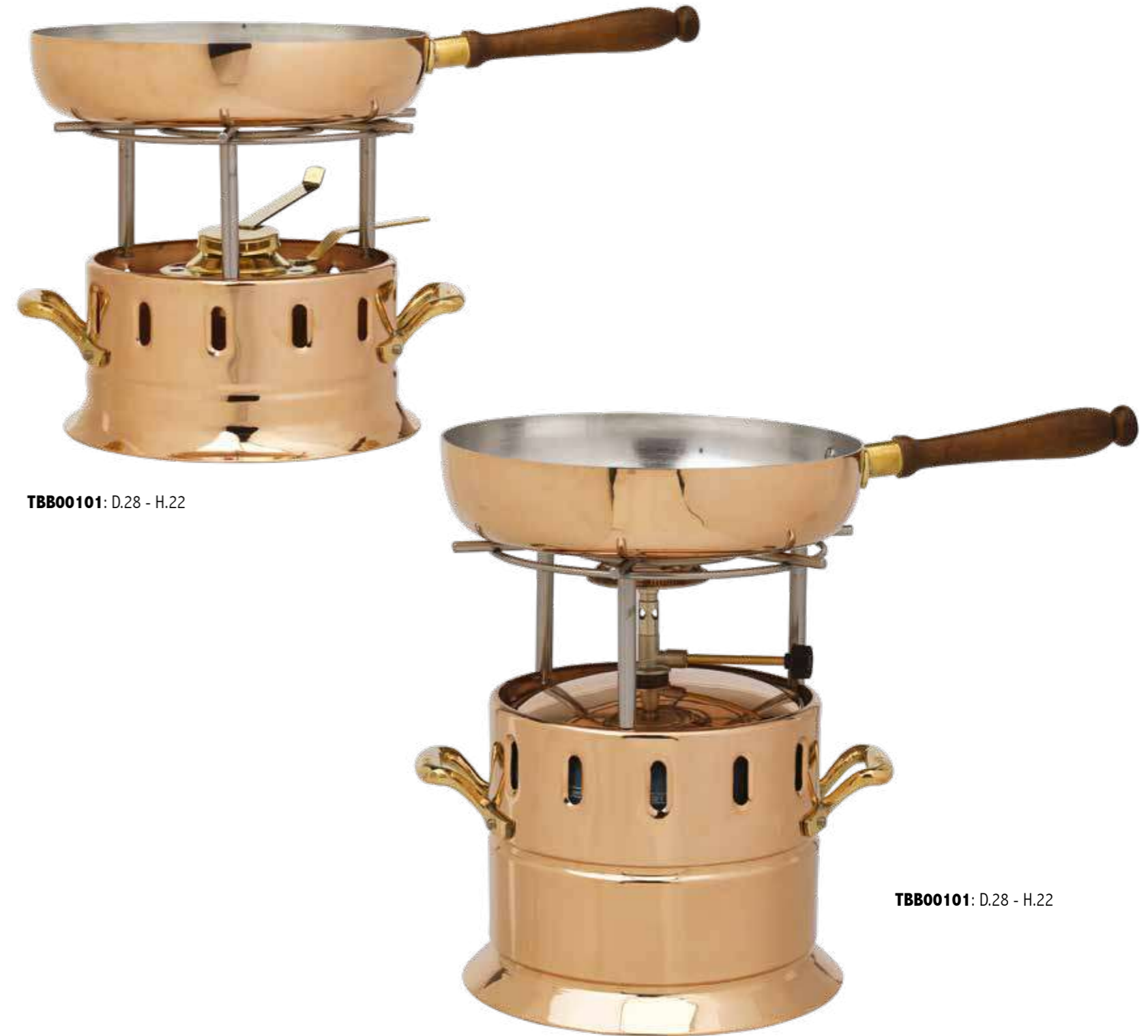
TBB00101: D.28 - H.22