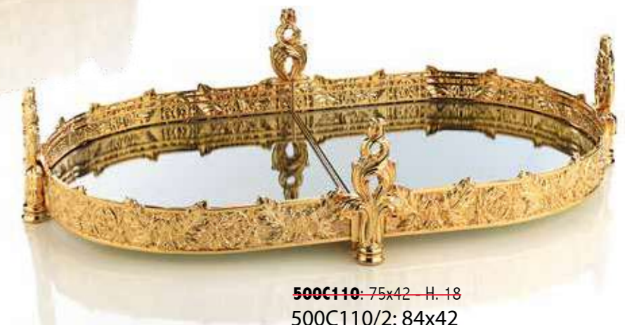
500C110: 75x42 - H. 18 500C110/2: 84x42