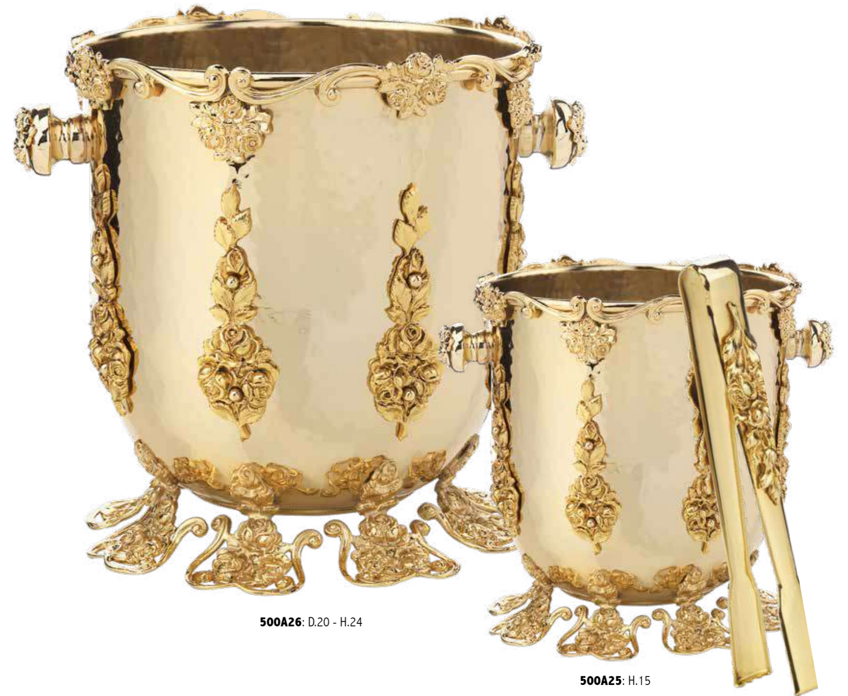
500A26: D.20 - H.24