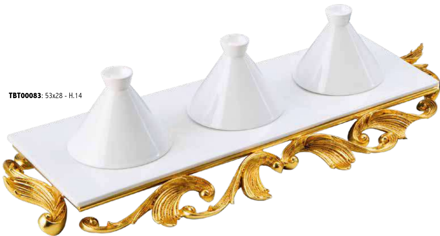
TBT00083: 53x28 - H.14

PORCELAIN AND BRONZE GOLD OR SILVER FINISHING