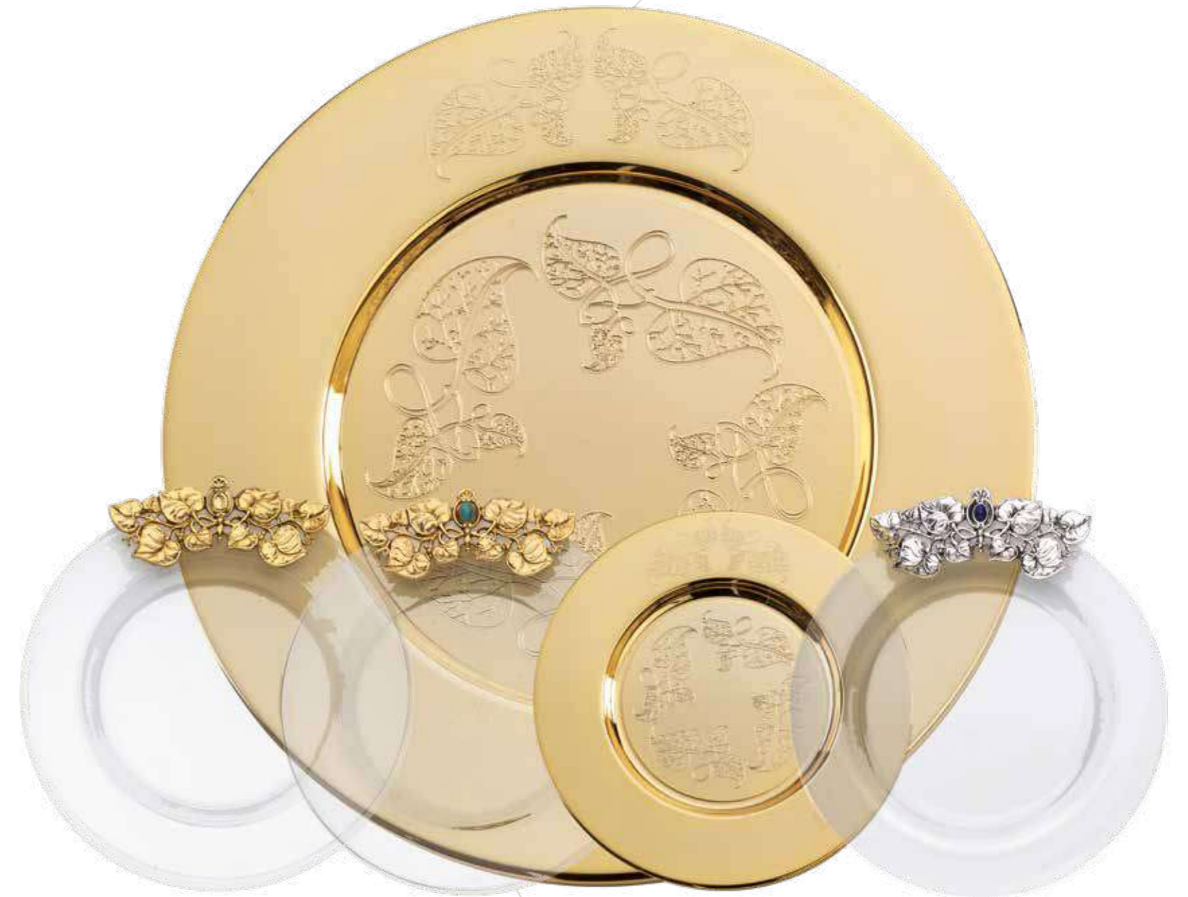
500B042: GLASS BREAD PLATE WITH METAL ORNAMENT - 500C042: ENGRAVED METAL BREAD PLATE - 500C047: ENGRAVED METAL CHARGER PLATE