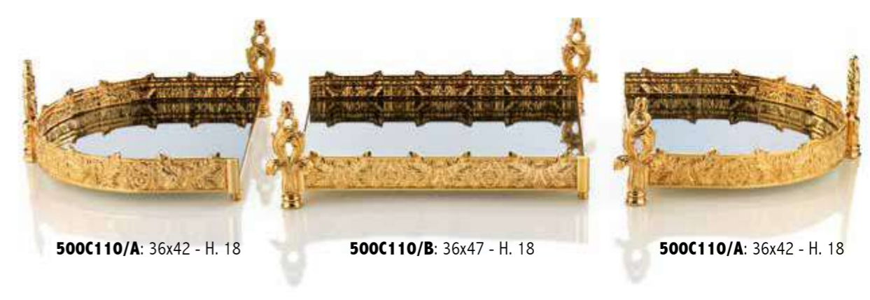
500C110/A: 36x42 - H. 18