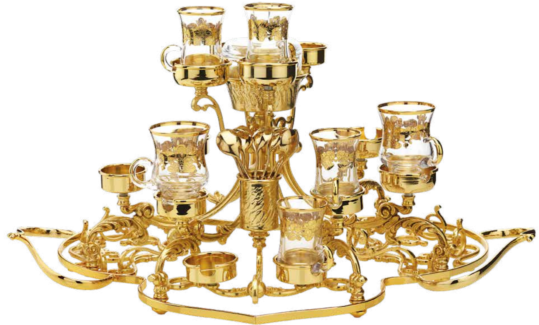
500C013/B: 59x40 - H.32